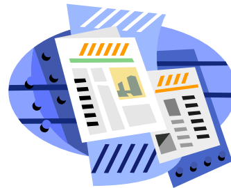
Housing Authority of Walker County Newsletter!!!!!!!!!!

zation reports and articles from HAWC staff members. In addition, we will notify you of any upcoming inspections, lease changes, fee changes and any other relevant information to you as the resident. So please take some time every few months and read through what we have to offer to in our new and exciting newsletter.